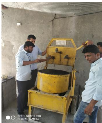
Figure: Mixing of pervious concrete