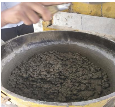
Figure : Prepared mix