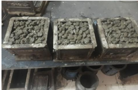
Figure : Cubes for compressive strength testing

strength. However, currently there is no ASTM test standard for compressive strength of pervious concrete. Testing variability measured with various draft test methods has been found to be high and therefore compressive strength is not recommended as an acceptance criterion. Rather, it is recommended that a target void content (between 15% to 25%) as measured by ASTM C 1688: Standard Test Method for Density and Void Content of Freshly Mixed Pervious Concrete be specified for quality assurance and acceptance.